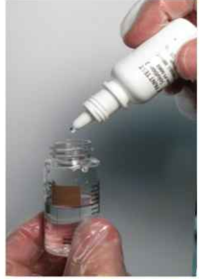
Add 5 drops of Test Solution 2 to the bottle of Test Solution 1 containing sample, close. Shake 10 seconds.

Look through the bottle Viewing Window. Compare the Test Solution color to the Test Standard printed above the Viewing Window.