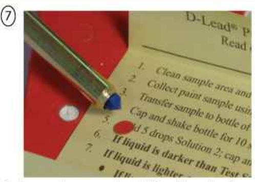
If the entire sample is lifted by the Scoring Tool, then use the Cleaning Rod to push the sample onto the Sample Catch Tray.