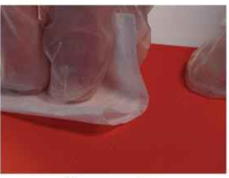
Clean sample area