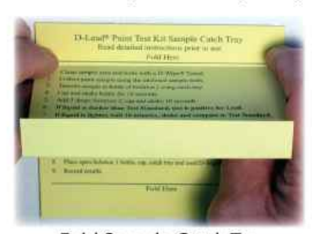
Fold Sample Catch Tray