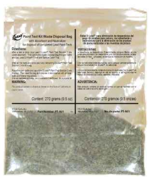
Sample gloves, eye protection and hammer not included.